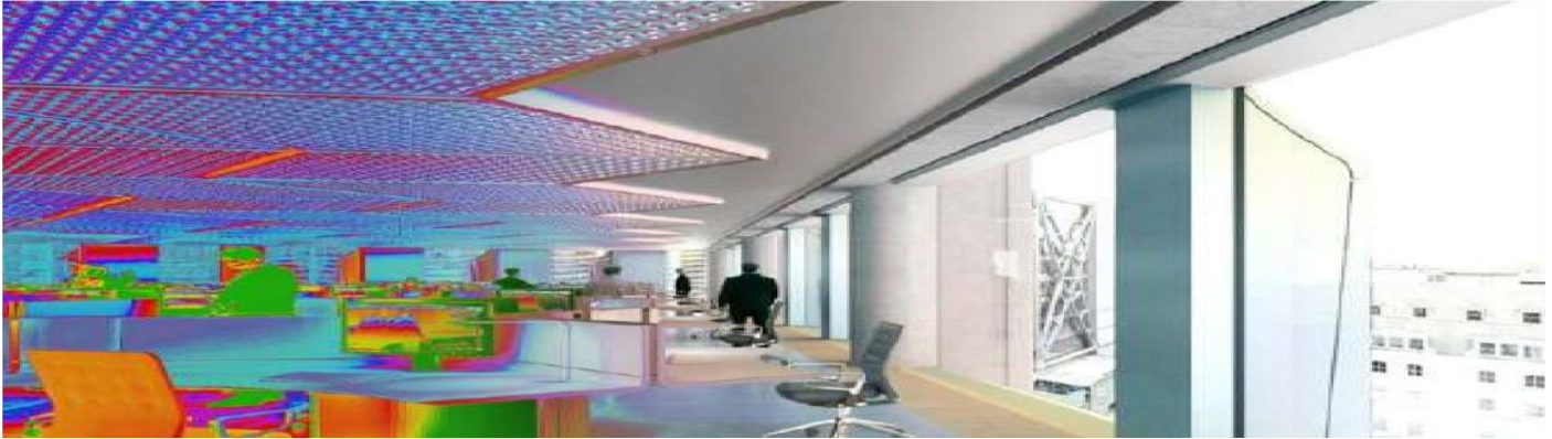
Figure 3: Analysis of light, heat, air, and sound movement through a building