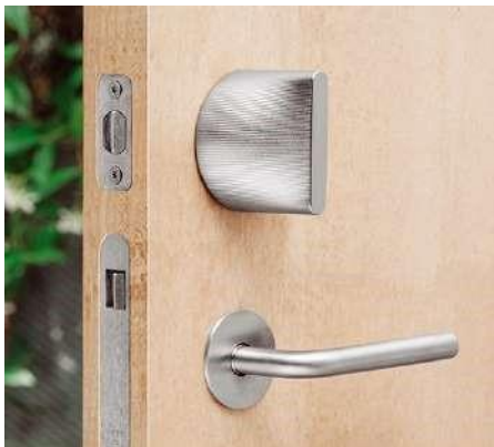
Figure 4: Friday Smart Lock

Another highly regarded architectural practice, Bjarke Ingels, has expanded its expertise to include product design and creation (Archipreneur, 2015a: 2). In 2014, the group started the BIG Ideas unit with the intention of broadening the scope of work undertaken by the practice (Archipreneur, 2015b: 1). Its website claims that “we have explored personal technology, urban mobility and furniture. With BIG Ideas we feel we can close the gap and really make our interest in product design a literal extension of our efforts in architecture. The Friday Smart Lock is the latest product developed in partnership with Friday Home” (BIG ideas, [n.d.]) (see Figure 4).