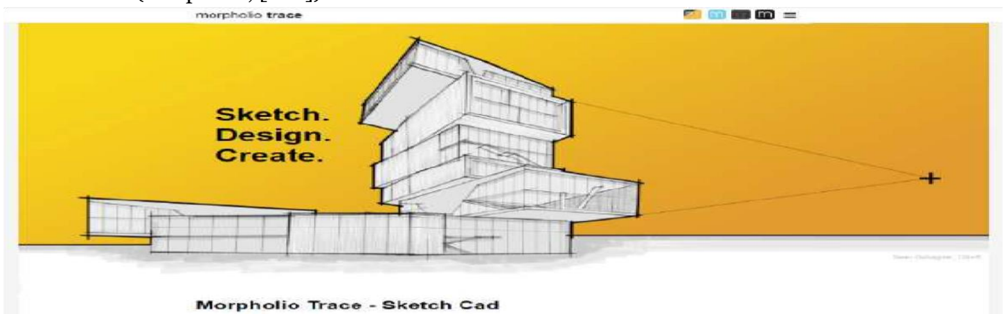
Figure 14: Morpholio Trace marketing material

Morpholio provides software that supports the creative processes used by architects, designers, artists, engineers, photographers, or any imaginative individual (Morpholio, [n.d.]). The firm was started by architect Anna Kennof and three other architects. The aim of their mobile tools is to enhance the creative design process. Being of the opinion that ‘thinking with your hands’ is a critical component of the design process, they developed applications (apps) that aid the design process, particularly for use on tablets. Users pay a subscription fee to use their products (Archipreneur, 2018: 2-3). Their flagship app is called Trace (see Figure 14). Morpholio Trace was developed for use with Apple’s iPad Pro and the Apple pencil. It replicates the process of overlaying a photograph or drawing with tracing paper and using freehand technique to develop design ideas (Archipreneur, 2018: 5). Other products are ‘Board’ and ‘Journal’ (Morpholio, [n.d.]).