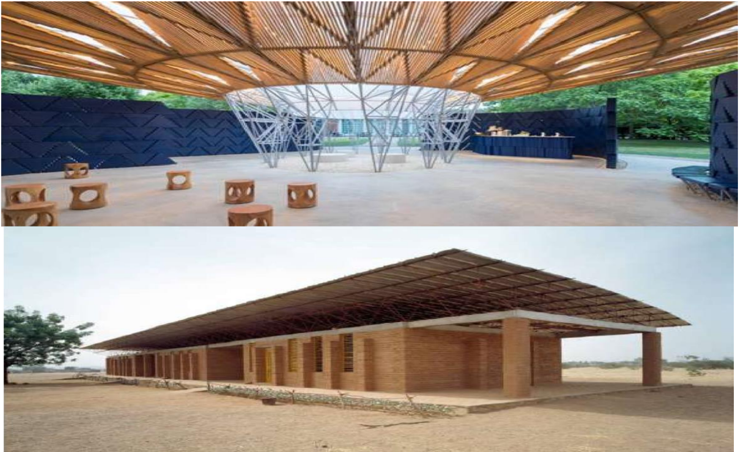
Figure 9: Ziba Stools at the Serpentine Pavilion.