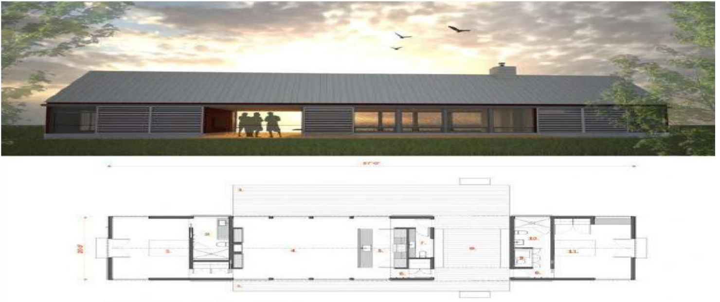
Figure 12: Productised Longhouse plan and elevation by Eric Reinholdt