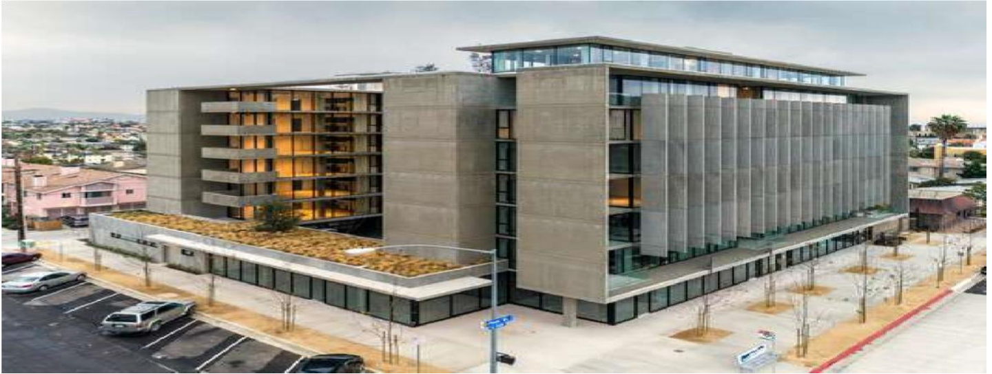
Figure 8: Park and Polk, San Diego (2018). Photograph by Matthew Segal and Jeff Durkin