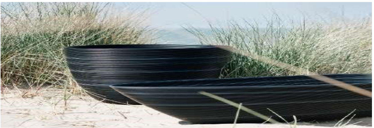
Figure 13: 3D-printed planters designed by House of DUS