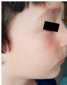
Fig. 7 – 1 year later