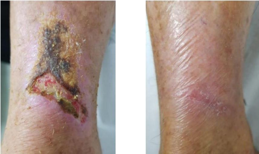
Fig. 8 – 1 st day of service Fig. 9 – 28 th day of service