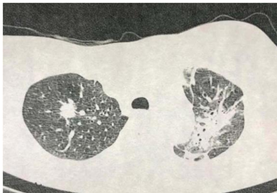
Fig. 3 - 1 st meeting – Sagittal Tomography without contrast