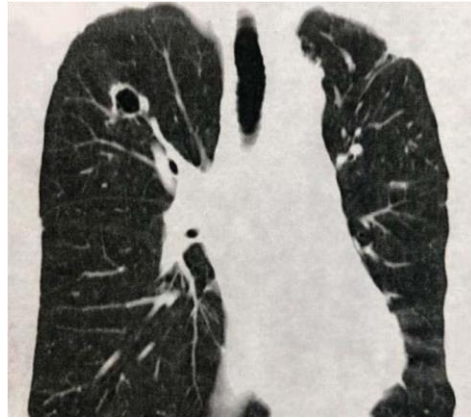
Fig. 2 – 4 th meeting (28 th day) – Front CT without contrast