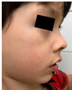
Fig. 6 – 1 month later