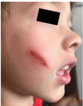
Fig. 5 – accident day